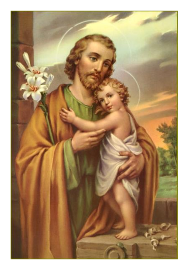
St. Joseph Pray for Us